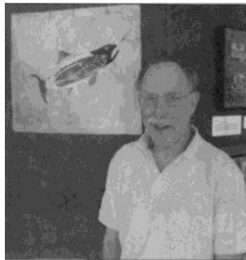
Tom Berns produced two collage paintings on fabric, both featuring fish: "In My Dreams I" and "In My Dreams II," using recycled materials.